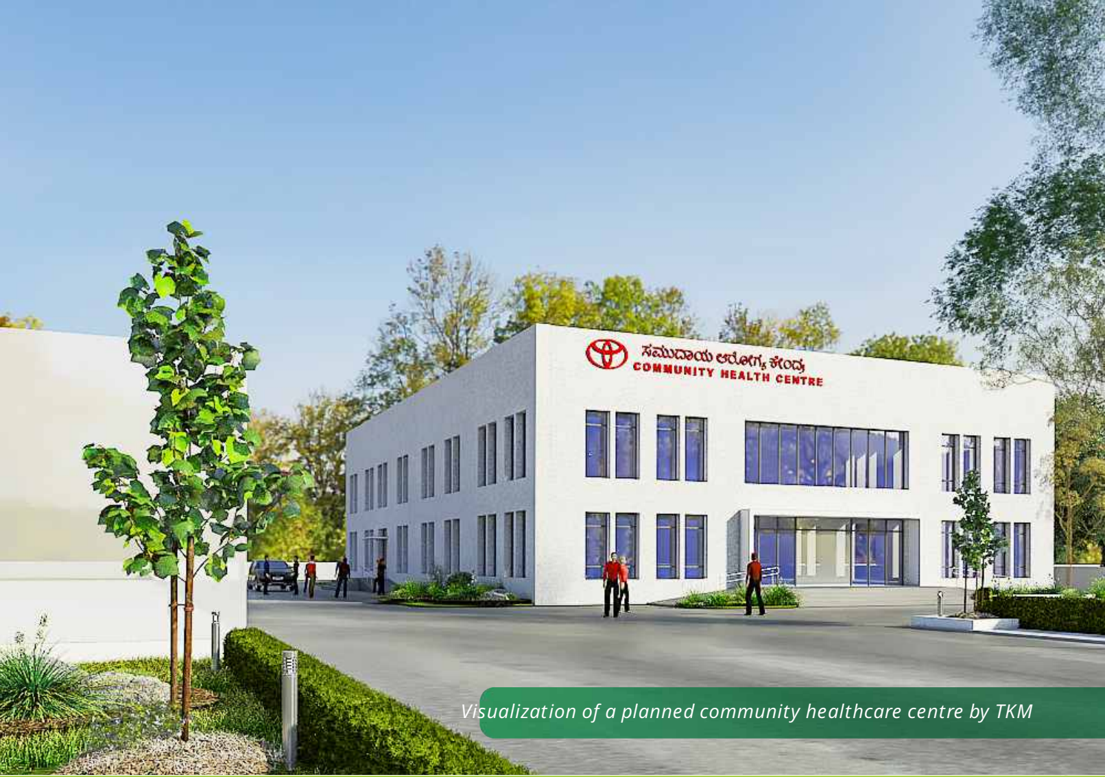
Visualization of a planned community healthcare centre by TKM