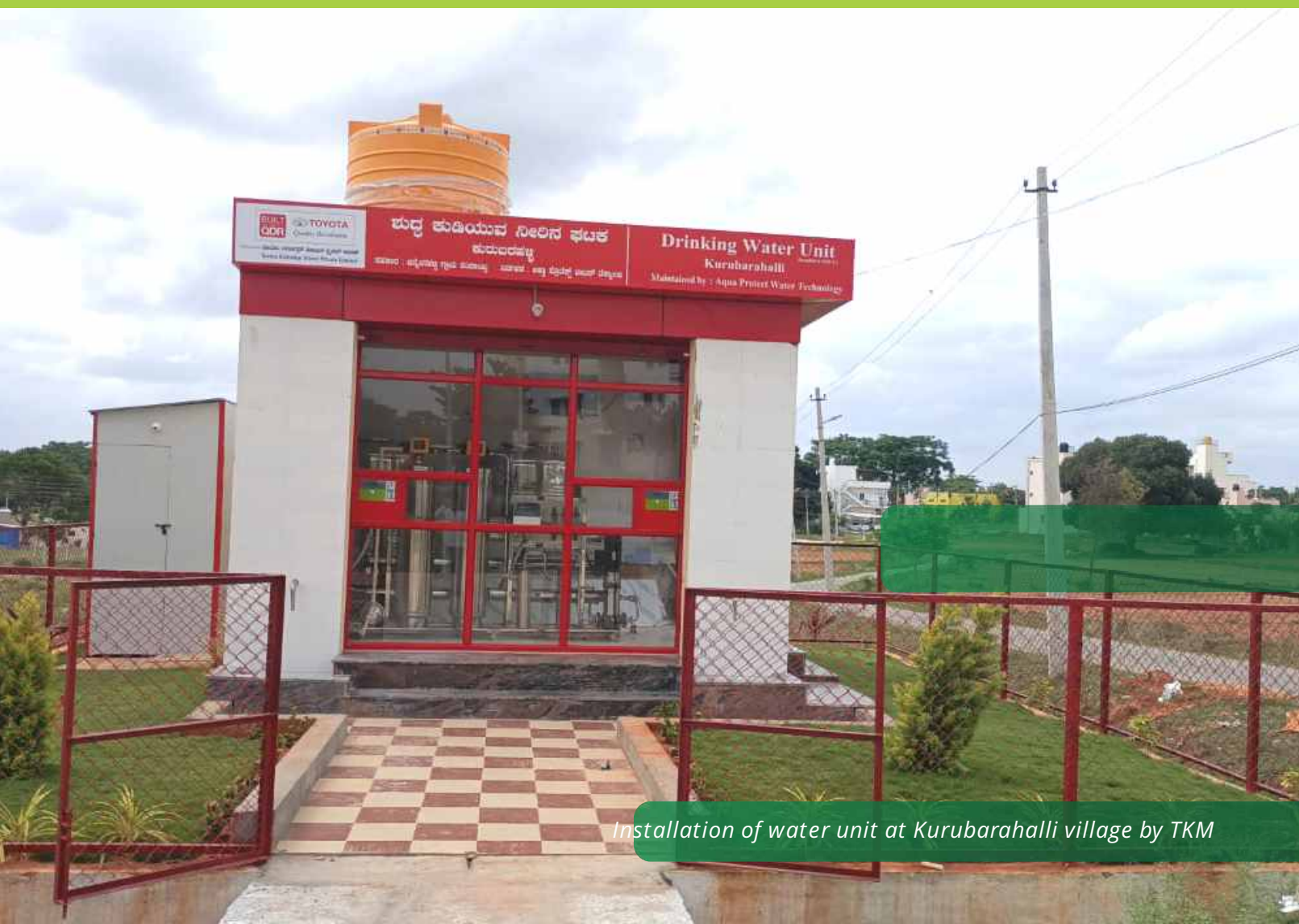
Installation of water unit at Kurubarahalli village by TKM