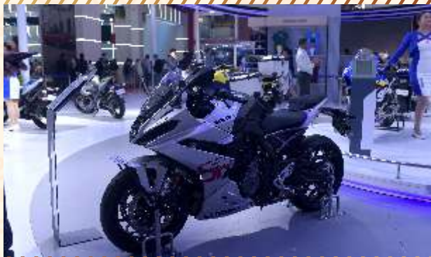
Suzuki Motorcycle India