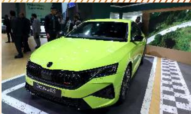
Skoda Auto Volkswagen India