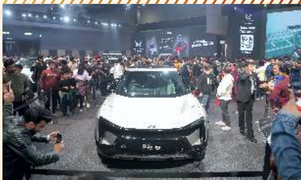
Mahindra & Mahindra