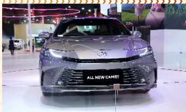
Toyota Kirloskar Motor