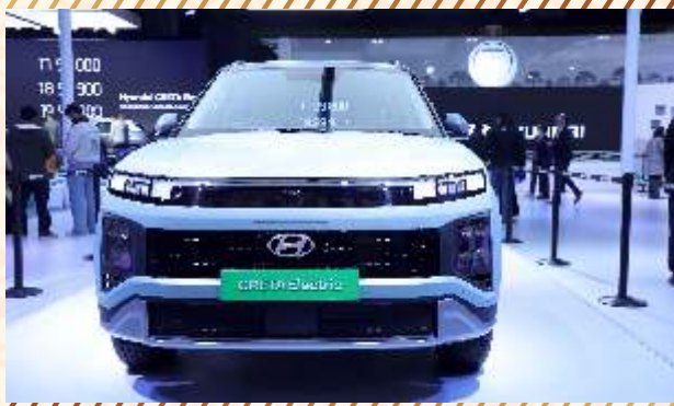
Hyundai Motor India