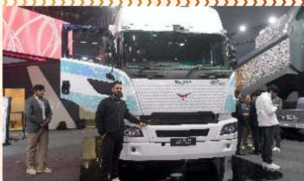
TI Clean Mobility