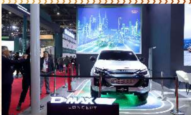
Isuzu Motors India