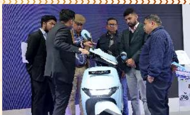
Honda Motorcycle and Scooter India