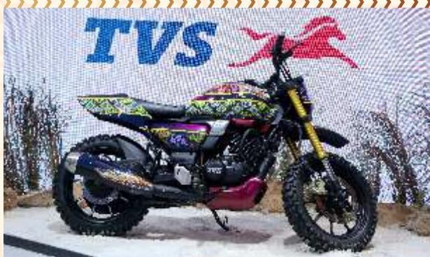
TVS Motor Company