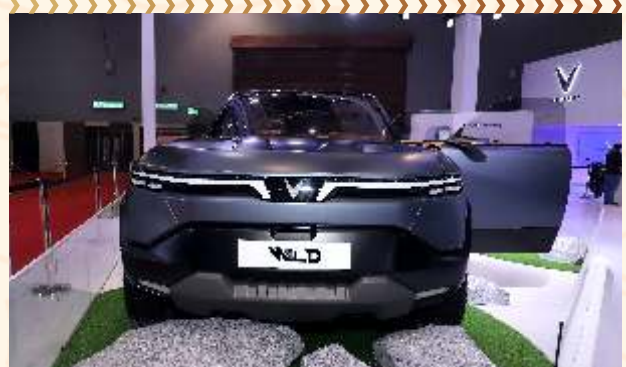
Vinfast Auto India