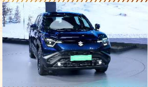
Maruti Suzuki India