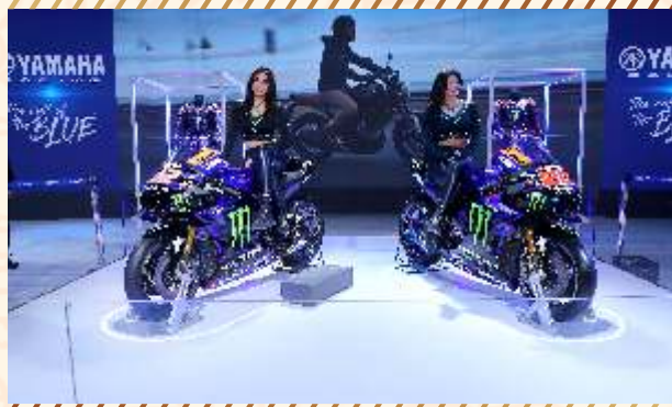
India Yamaha Motor