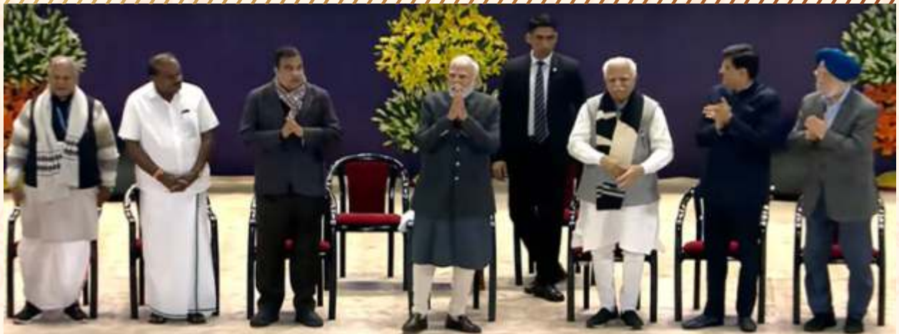
Shri Jitan Ram Manjhi, Union Minister for Micro, Small and Medium Enterprises; Shri H D Kumaraswamy, Union Minister for Heavy Industries and Steel; Shri Nitin Gadkari, Union Minister for Road Transport and Highways; Shri Narendra Modi, Prime Minister of India; Shri Manohar Lal, Union Minister for Housing and Urban Affairs & Power; Shri Piyush Goyal, Union Minister for Commerce and Industry; Shri Hardeep Singh Puri, Union Minister for Petroleum and Natural Gas

Hon'ble Prime Minister Shri Narendra Modi inaugurated the Bharat Mobility Global Expo 2025 at Bharat Mandapam, New Delhi.