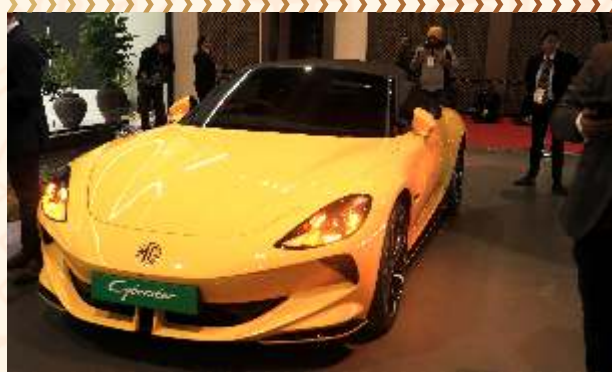
JSW MG Motor India