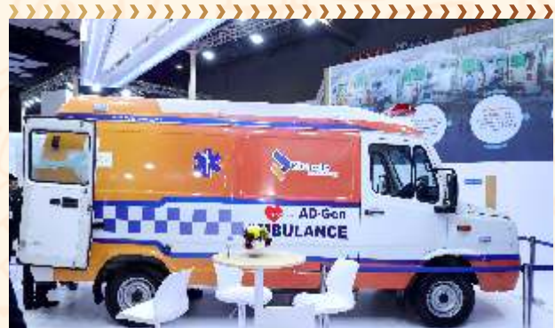
Pinnacle Mobility Solutions