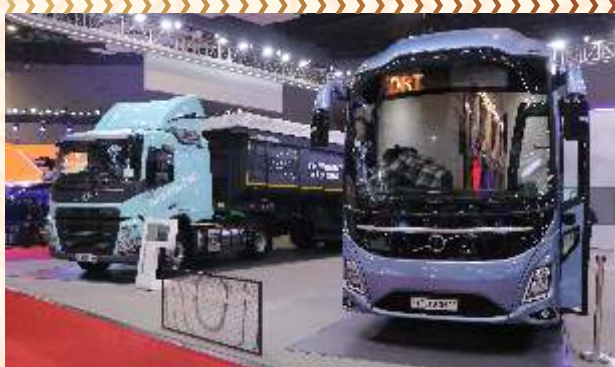
Volvo Eicher Commercial Vehicles